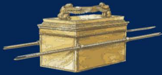
Ark of the Covenant