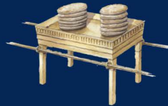
Table of Showbread