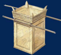
Altar of Incense