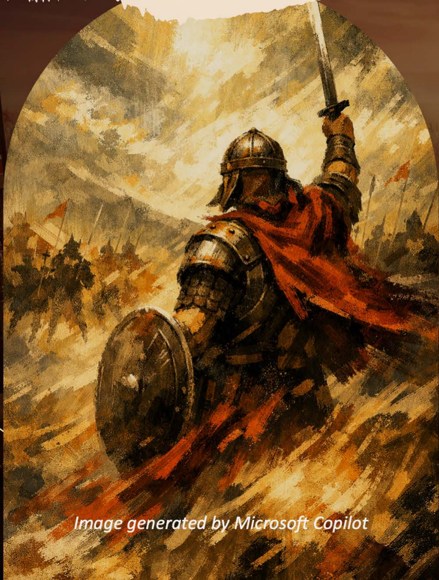
Image generated by Microsoft Copilot