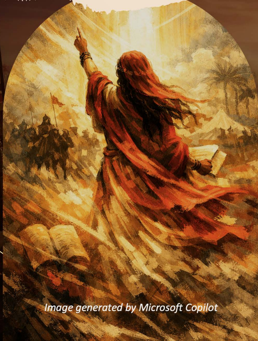
Image generated by Microsoft Copilot